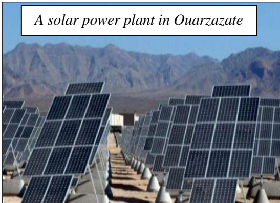
A solar power plant in Ouarzazate

[4] With a capacity of 580 megawatts, Noor power station is expected to occupy a space as big as the city of Rabat and provide electricity to 1 million homes. It is the fruit of the country's efforts in recent years to reduce dependence on imported energy. The first phase of the project, Noor 1, is already operating. This first station alone can produce a power equivalent to 160 megawatts and provide energy to 650,000 locals from sunrise until three hours after sunset. Noor 2 and Noor 3 will follow soon. Environmentally, once the three plants are operational, gas emissions should decrease significantly.